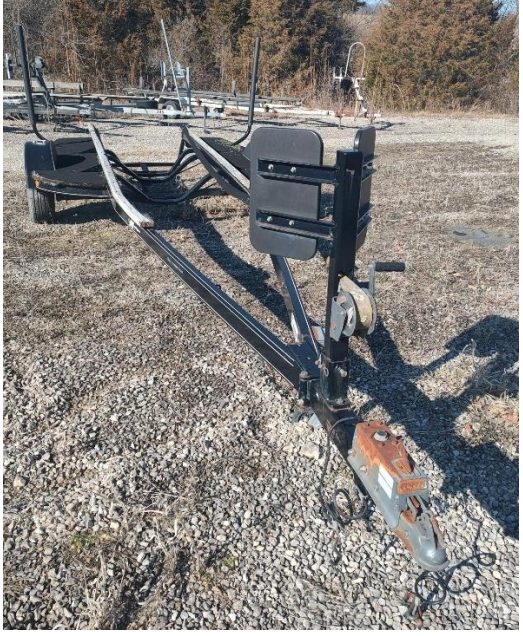
Page 2 of 4